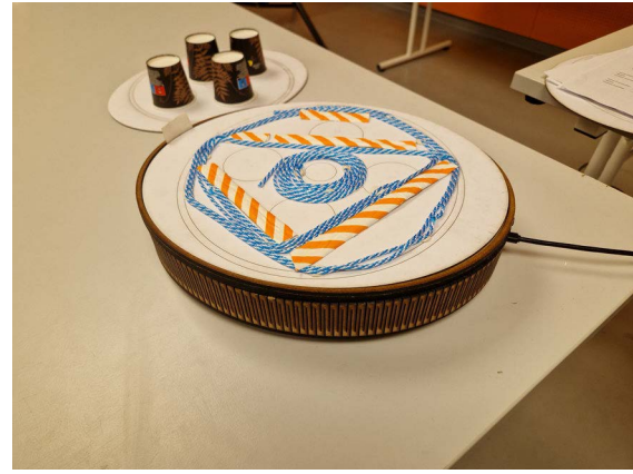
Figure 6. P2's Score.

The magnets were carefully distanced to not collapse into each other through their reciprocal attraction. Some of the magnets were placed on top of wooden sticks, others on top of magnetic stripes. As soon as the oval was placed on top of Stacco, its four attractors broke the balance and caused the system to collapse.