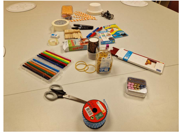
Figure 4. Workshop Material.

are displaced in four symmetrical points underneath an oval wooden board and connected to a Bela [27] for embedded synthesis. The 32 x 217 cm engraved board features a raised edge and is enclosed via a living hinge structure.