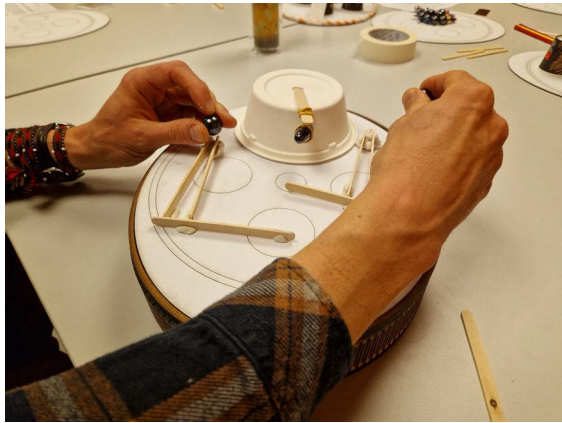
Figure 8. P4's Score.

cessive reconfigurations of the architecture, moving the spheres along the paths of the wooden rails placed on top of the attractors. Finally, P5 developed a narrative around a magnetic persona, with a larger magnetic sphere as the body and head, and arms and legs made of smaller magnets. P5 built a series of structures with straws, clay and rubber bands around three of the attractors, and titled the score A Day in the Park . By wandering through the score, climbing and sliding on top of straws and sticks of different heights, the character modulated Stacco's magnetic fields. As P5 noted, the work was "more as a sculpture than a practical thing." In P5's open-world score, all interactions, and in particular those elicited by gravity, are redefined as magnetism. Coherently, the sole model chosen for the performance was the magnets one.