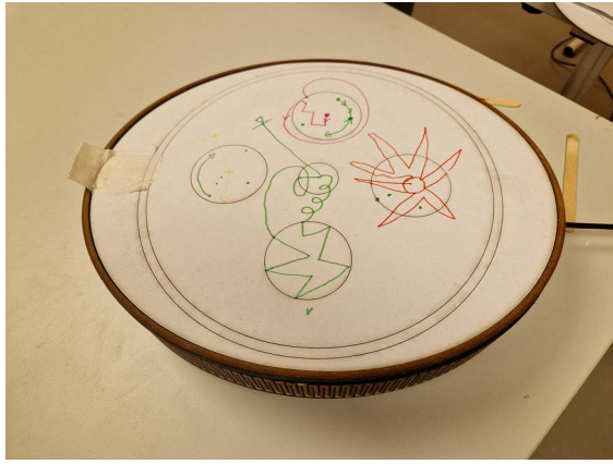
Figure 7. P3's Score.