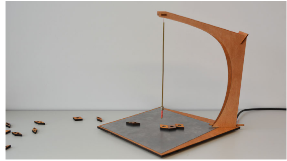
Figure 2. Giacomo Lepri's Chowndolo.

The instrument-scores mentioned above have a distinct embodied character, as they encode the inscription within the materiality of the interface, with the performer interpreting it through touch and gestures. This materiality is apparent in the score's resistance and action in response to the performer's gestures, empowering creativity and boosting the communication between the performer and the audience [15]. Our research aims to leverage such material