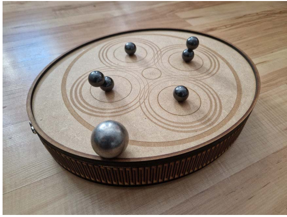
Figure 3. Stacco.