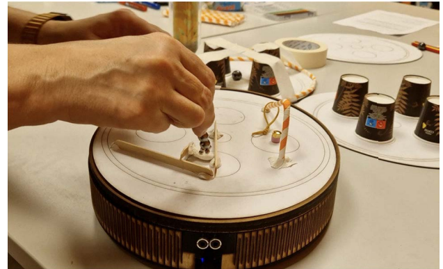
Figure 9. P5's Score.

Once the scores were completed, the participants presented them and played for the group. In this section, we will observe how the scores redefined the gestural and sonic interactions with Stacco by comparing the initial open explorations with the final performance, and including insights from the conversation that followed. This section includes observations from P1 to P4, P5 chose to explore the score alone and during the group's break. For this reason, we chose to not record this performance.