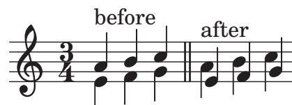
Figure 1. An edit that switches the first and second voices in a staff. Stem direction is the only visual difference, but the underlying representation changes substantially.

There are several benefits to the Zhang and Shasha tree edit difference algorithm. First, the algorithm produces a tree edit distance that can function flexibly as a metric (assuming the cost function is also a metric). For example, collaborators can use distance metrics to explore the similarity of an entire corpus of musical scores—rather than just two scores—because the metric's notion of distance aligns with our intuition about distance in the physical world. This distance metaphor allows designers to leverage existing musical research in topological feature similarity metrics, which expands the algorithm's utility beyond the notion of hierarchic diff, into new applications such as automated recommendations based on similarity measures [11, 12, 13]. Second, the algorithm is relatively simple and lends itself to a straightforward implementation that can be maintained by an open-source community. The intent of the open-source community is to support an extensible framework for hierarchical comparison of a wide variety of document types across a number of domains. In the future, other algorithms, such as those mentioned above, may be implemented to understand more about the effect of different tree-edit distance algorithms on similarity results.